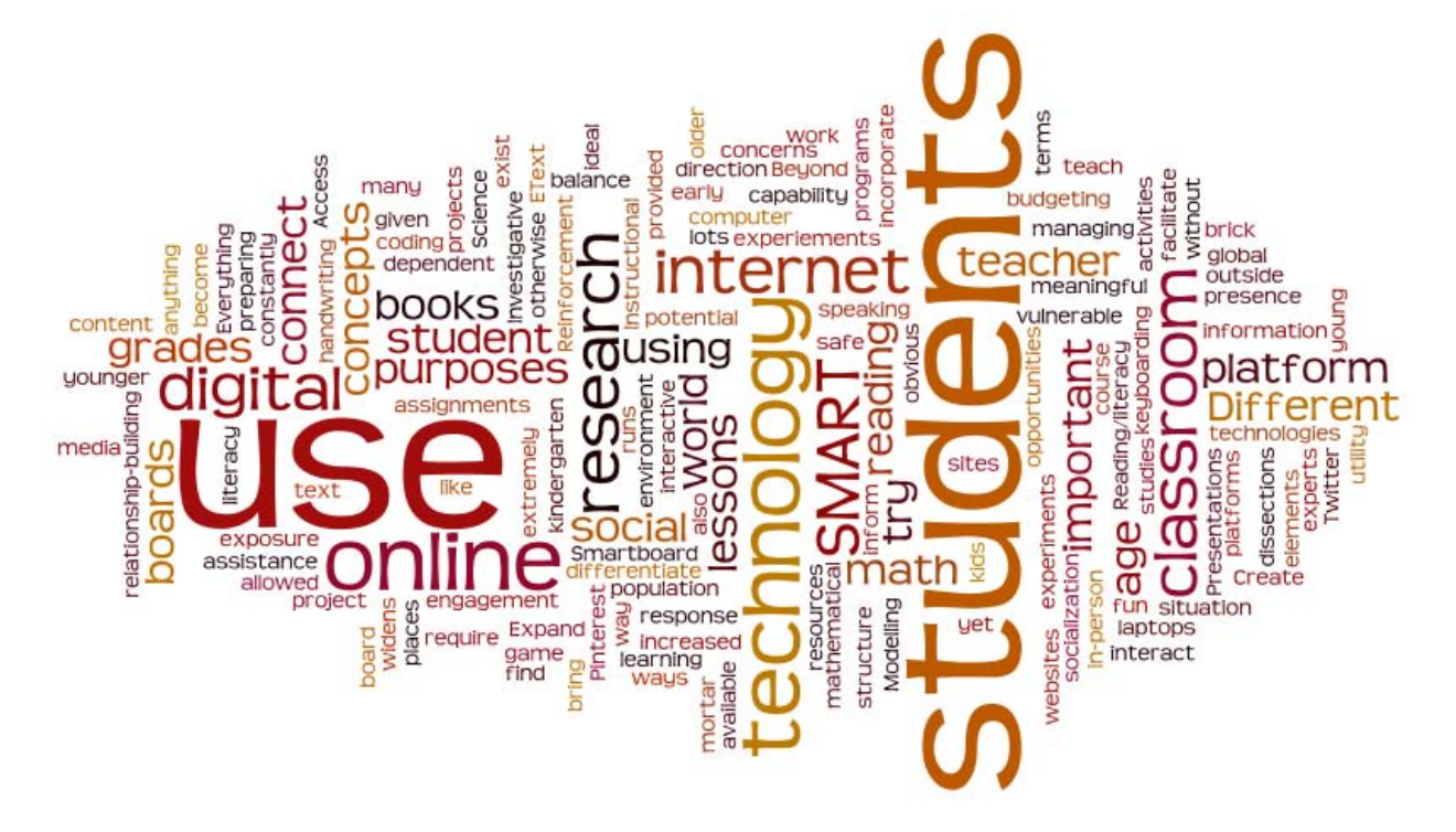
Figure 6. What are ways you would use digital technologies in the classroom?

In my survey when I asked my participants how the incorporation of digital technologies improves elementary education, Participant 11 offered, "Technology is the future. Those who use it, understand it, and program will be the business leaders of the future. It permits global learning, we are not so isolated from the rest of the world, we have instant updates on everything, and our world is not so narrow. Technology allows you to access demonstrations, experiments, and courses. With subjects such as math, we used to use abacus and blocks to practice. We can now use technological manipulatives to practice. We have the ability to introduce digital textbooks which are much more manageable and efficient." Eliminating the use of digital technologies in the classroom as a way to eliminate the digital divide deprives students from engaging in technologically rich experiences, such as accessing information for research, being part in an online community responsibly through social media or discussion forums, using them as a multiple means of representation, and other suggestions from my survey touched on in