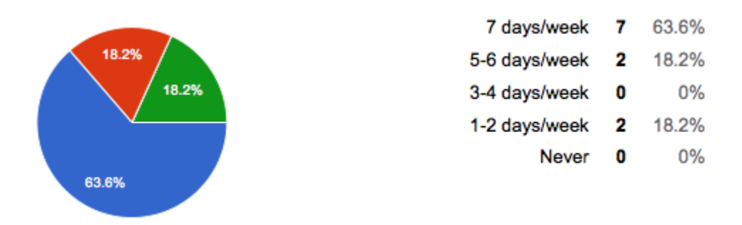
Figure 2. How often do you use digital technology outside of the classroom?

of appropriate technology selection. ... You need teachers and staff to be well trained in how to use the technology - if they can't use it, then when a child needs help they can't offer that support effectively" (personal communication, November 9, 2015). There has been a shift in the way we use technology in education to activate learning, and the lack of shift creates the SLDD.